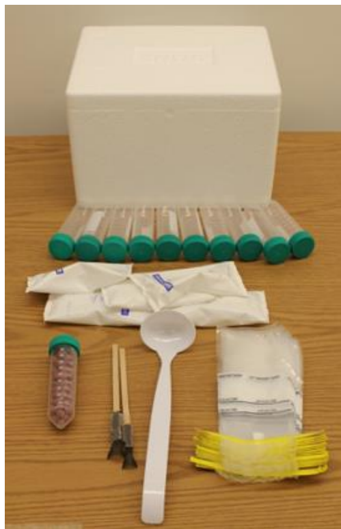
Materials included in the kit