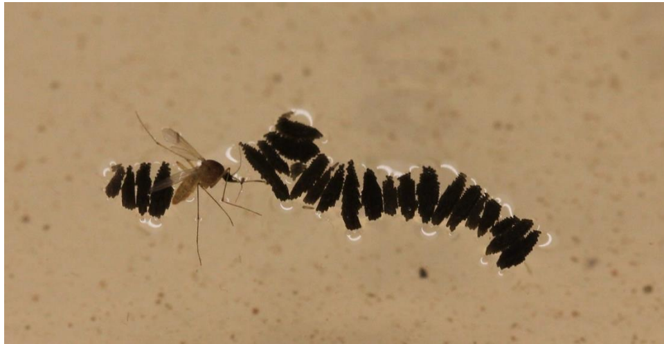
Egg rafts with adult Cx. pipiens for scale